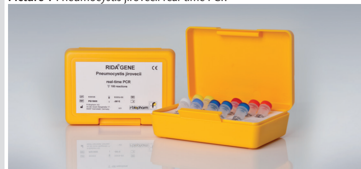
Picture 1 Pneumocystis jirovecii real-time PCR